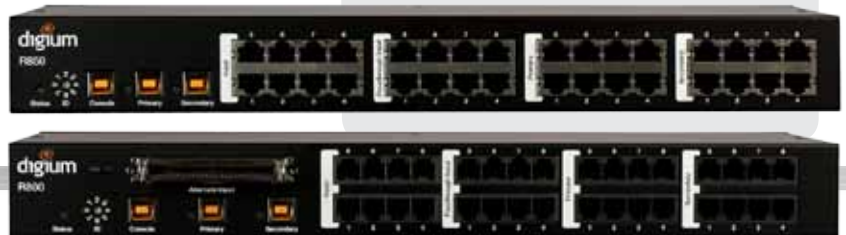
Digium R850 (top photo) and R800