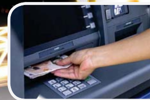
Retail and Banking